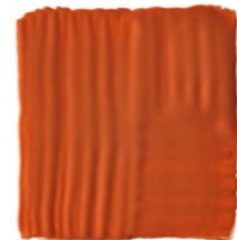
Russet No 4 emulsion, £40 for 2.5L, Pots of Paint

Warm and robust, Russet No 4 has a vibrancy that would work well on a feature wall. It's fantastic on vintage furniture – gilt finishes are the perfect accompaniment. Powerful in a south-facing room and cosy in a north-facing space. EDWARD BULMER POTS OF PAINT