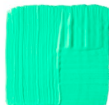
Agave Ecos Super Chalky matt, £28.65 for 2.5L, Ecos Organic Paints