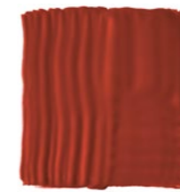
Satchel Red Low Sheen emulsion, £42 for 2.5L, Konig Colours

Satchel Red is deep and earthy with a brown undertone inspired by clay pottery and worn leather. Use with flagstone floors and vibrant bohemian textiles with pink and orange accents and add in Moroccan-style tiles for an eclectic look. VANESSA GALLOWAY KONIG COLOURS