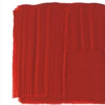
Bronze Red 15 Absolute matt emulsion, £37 for 2.5L, Little Greene

Bronze Red (above) has a boundless, rich tone that's synonymous with the sands of the Sahara. Set against bold blues and golden yellows, it adds depth and harmony; or team with Hollyhock and Yellow-pink for a softer look. DAVID MOTTERSHEAD LITTLE GREENE