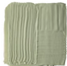
Bamboo Leaf emulsion, £24.99 for 2.5L, Crown

The agave plant prefers shade in its home in the Mexican desert and the same could be said of the paint colour Agave; its blue-green undertones are enhanced in shady rooms. Team with soft heather – the colour of its flowers. IAN WEST ECOS ORGANIC PAINTS