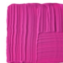
Summer Plum emulsion, £34.50 for 2.5L, Eicó Paints

Summer Plum (similar to above) is a sassy, delicious hue, perfect for creating a summer feeling all year long. Use it in an alcove or as feature wall, or choose a room that can carry this bold shade, such as an office or bathroom. RISHI SUBEATHAR EICÓ PAINTS