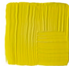
Melancholy Monkey Premium emulsion, £26.98 for 2.5L, Valspar

Nothing inspires quite like yellow and despite the name, Melancholy Monkey (above) is a happy and optimistic colour that lifts the mood. Combine it with tones of grey or deep shades of plum to create an energising scheme. CLAIRE CULLEN VALSPAR