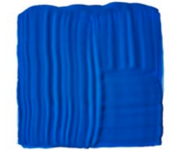
Blue Moon matt emulsion, £41 for 2.5L, Sanderson

Evocative of the deep, night desert sky, Blue Moon creates a feeling of vastness. Almost velvety, it has endless possibilities and envelops an interior, creating a feeling of warmth and calm. Use with richer metallic tones and spiced hues. REBECCA CRAIG SANDERSON